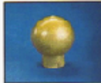
Finish: Brass/bronze/gold/white/natural wood

Approved by the Board of Directors in June 2004